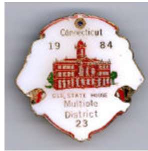
1984 CT State Pin Shows the Old State House, which is located at the Isle of Safety in downtown Hartford, our state Capital.

For membership information, please contact Lion Ralph Dolan, P.O. Box 1594; Torrington, CT 06790 or ralph.dolan@snet.net .