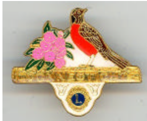
1972 CT State Pin Shown to the left, this pin shows the CT State Bird, the Robin and the CT State Flower, Mountain Laurel which booms in a light pink color at the